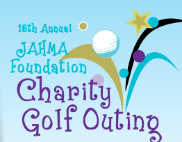
Golfers enjoyed the beautiful view and the thrill of winning.